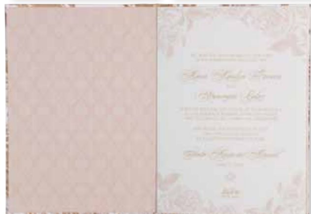
"Venetian Romance" custom book invitation handsewn with Japanese silk binding, featuring marble paper, custom artwork, and watercolor elements by Zenadia Design; zenadiadesign.com