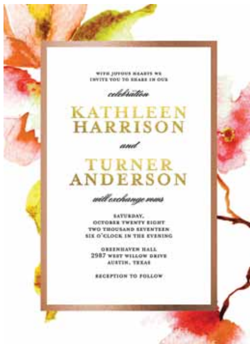
"Adorned Frame" digitally printed invitation with foil stamping by Wedding Paper Divas; weddingpaperdivas.com