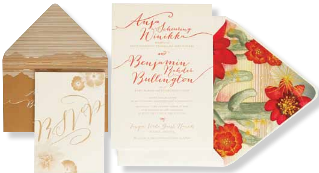
"Anja and Benjamin" couture invitation suite featuring two-color letterpress printing and hand-painted watercolor design by Ceci New York; cecineewyork.com