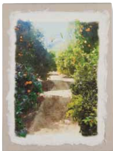
"Hummingbirds" invitation featuring a linen box with watercolor screen-printed on 100% cotton paper by Lehr and Black ; lehrandblack.com

We're thrilled to see that watercolor motifs have made a major comeback! Whether illustrated in fun brush strokes, picturesque backdrops, whimsical details, or a map that cleverly points guests in the right direction, these designs are a timeless touch year-round. The striking stationery sets featured here are either hand-painted watercolor compositions or include lovely watercolor-inspired elements.