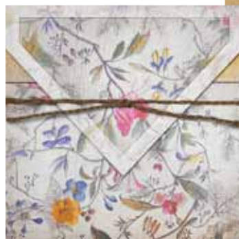
Foil-stamped custom invite with flat-printed watercolor bellyband and envelope with flat-printed watercolor liner by Nico and Lala ; nicoandlala.com