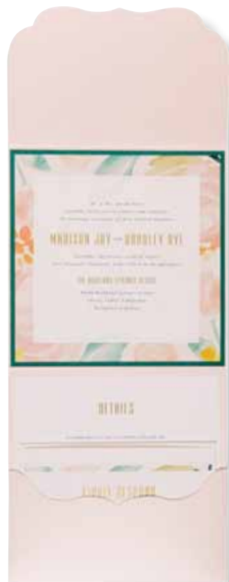
"Peony Garden" invitation with details and response cards in fold by Envelopments; envelopments.com