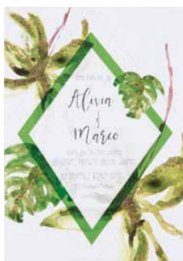
"Tropical Getaway" wedding invitation by Cassandra from Pretty Polite Print Boutique ; prettypolite.com