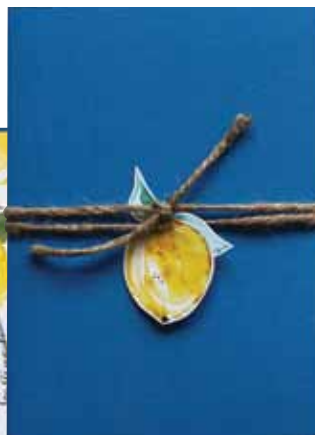
Custom hand-painted watercolor invitation, RSVP card, and map by Momenta Designs ; momentaldesigns.com