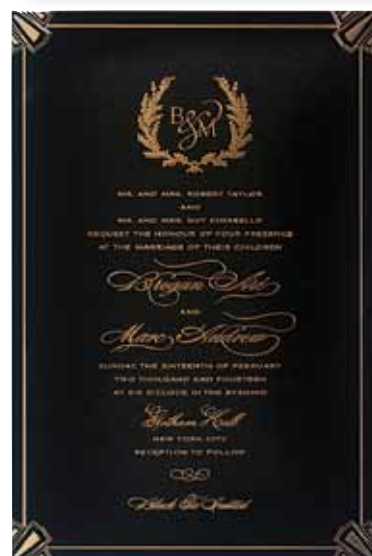
"Brogan & Marc" Art Deco invitation printed in gold foil on thick black card stock by Atelier Isabey; atelierisabey.com