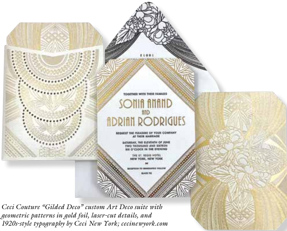
Ceci Couture "Gilded Deco" custom Art Deco suite with geometric patterns in gold foil, laser-cut details, and 1920s-style typography by Ceci New York; cecineewyork.com