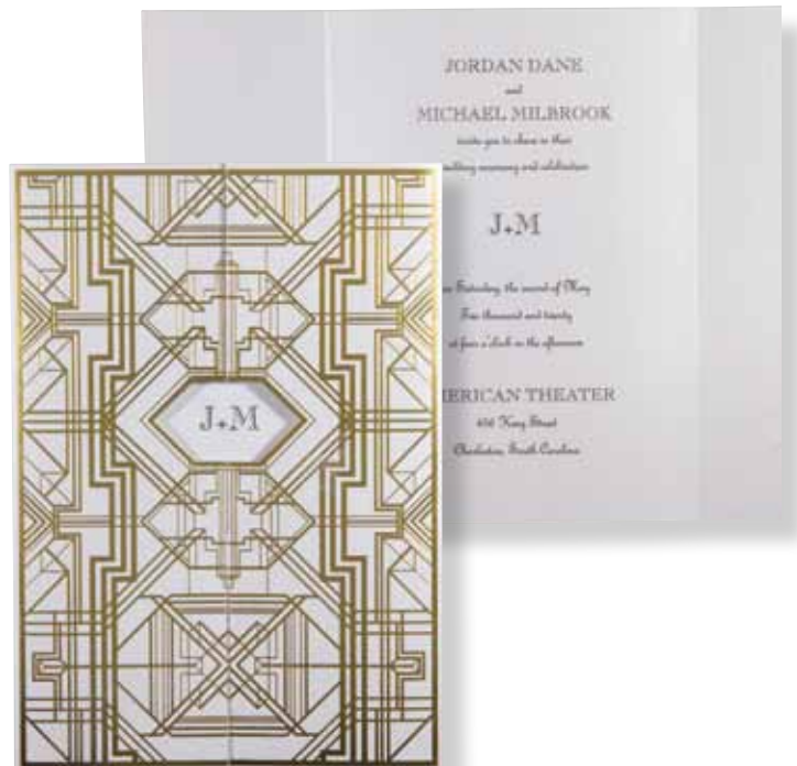
“Deco Wrap” gold foil tri-fold invitation by Carlson Craft; carlsoncraftproducts.com