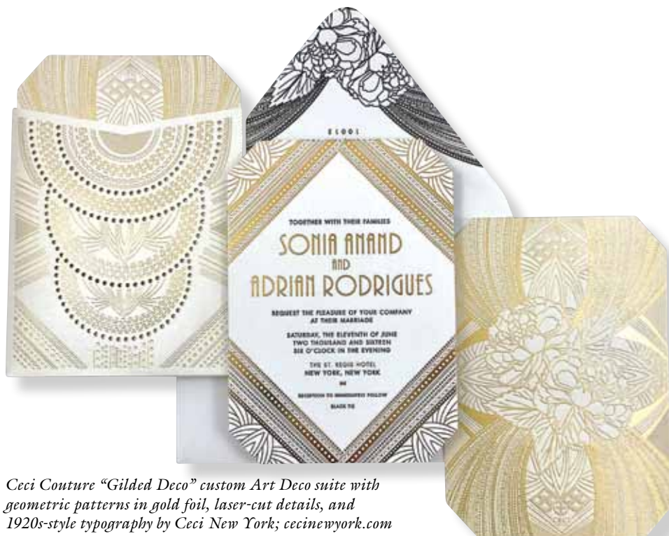
Ceci Couture "Gilded Deco" custom Art Deco suite with geometric patterns in gold foil, laser-cut details, and 1920s-style typography by Ceci New York; cecineewyork.com