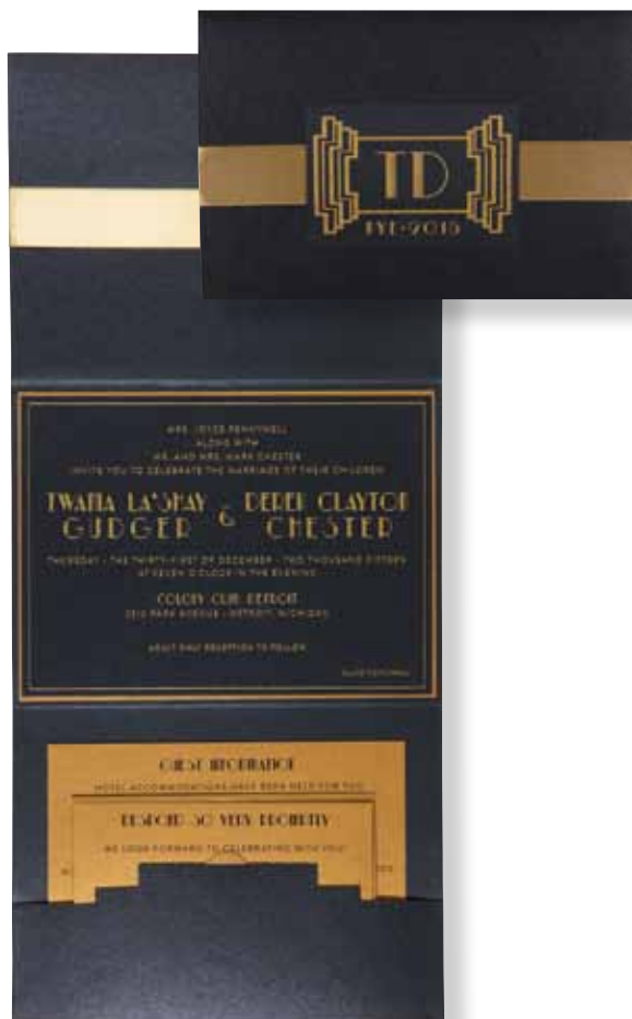
"Elegant Art Deco" invitation featuring a die-cut pocket with raised printing and custom monogram by Lepenn Designs; lepenndesigns.com