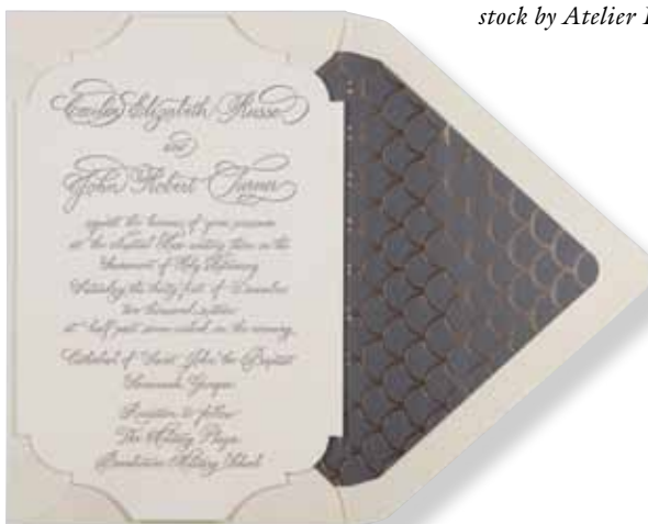
"Cecilia & Robert" custom letterpress suite featuring a die-cut invitation with calligraphy and scalloped envelope liner in taupe foil by Lowcountry Paper Co.; lowcountrypaperco.com