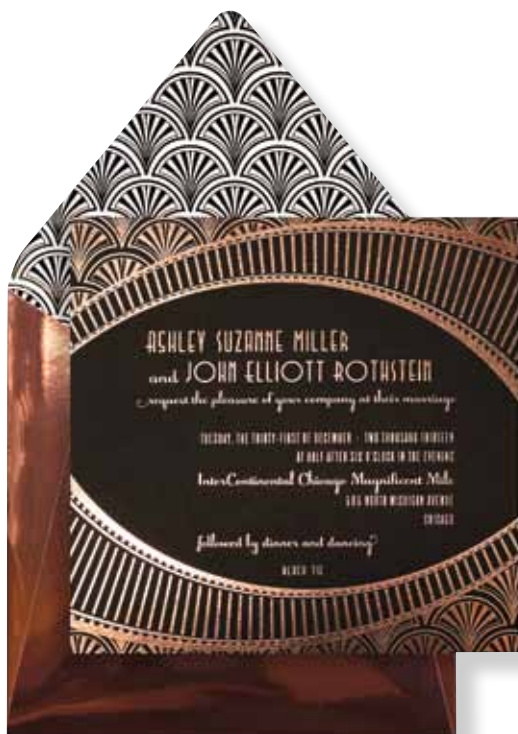
“Rose-Gold Retro” foil-stamped wedding invitation with custom envelope by Elizabeth Grace; elizabethgrace.com

Dazzling Art Deco-inspired wedding invitations that will leave a lasting impression.