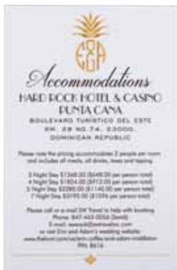
"Pineapple Glam" wedding invitation featuring gold foil, pineapple-print belly band, and envelope with striped liner along with die-cut events and accommodations cards by Nico and Lala; nicoandlala.com