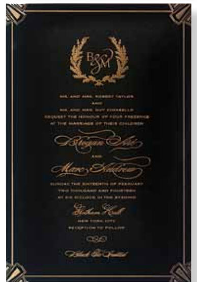
"Brogan & Marc" Art Deco invitation printed in gold foil on thick black card stock by Atelier Isabey; atelierisabey.com