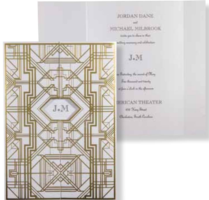
"Deco Wrap" gold foil tri-fold invitation by Carlson Craft; carlsoncraftproducts.com