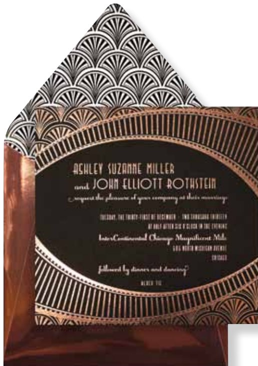
"Rose-Gold Retro" foil-stamped wedding invitation with custom envelope by Elizabeth Grace; elizabethgrace.com

Dazzling Art Deco-inspired wedding invitations that will leave a lasting impression.