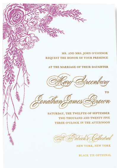
Invitation with hand-drawn florals from the Bouquet in Bloom Collection by Ceci New York; cecineewyork.com