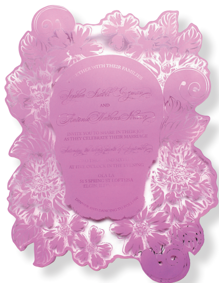
Acrylic invitation inspired by the Mexican holiday Día de los Muertos by Ijorere featuring handwriting by Calligraphy by Cristine; ijorere.com