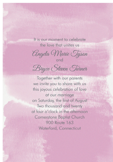
"Roll Tide" invitation in Radiant Orchid by Carlson Craft; carlsoncraft.com