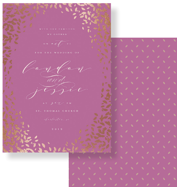
"Cascading Corners" foil-pressed wedding invitation featuring a patterned back by Lori Wemple for Minted; minted.com

From hometown affairs to destination weddings afar, this collection of pastel stationery prints are suitable for celebrations any time of year. The elegant suites range from artfully crafted acrylic options to sophisticated styles with hand-painted details, as well as plenty of new choices in foil printing. If you're looking for a cure to your winter blues, take a look at these invitations to add whimsical inspiration to your upcoming fête.