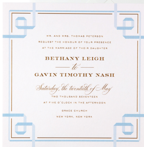
"Pratesi in Love" luxurious invitation and envelope with foil typography and ribbon border by Cheree Berry Paper; chereeberrypaper.com