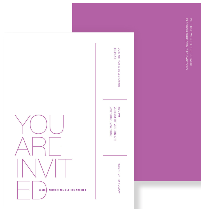
“Stacked Type” modern invitation with matching envelope (entire suite available) by Paper Culture; paperculture.com