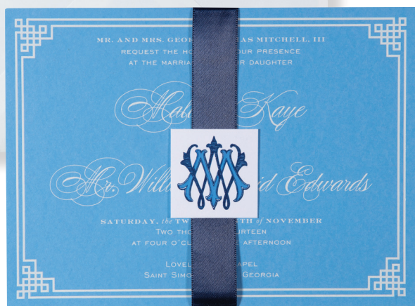
Custom chinoiserie-inspired invitation with white foil stamping, sealed with a classic interlocking monogram and satin ribbon, and corresponding lined envelope by Nico and Lala; nicoandlala.com