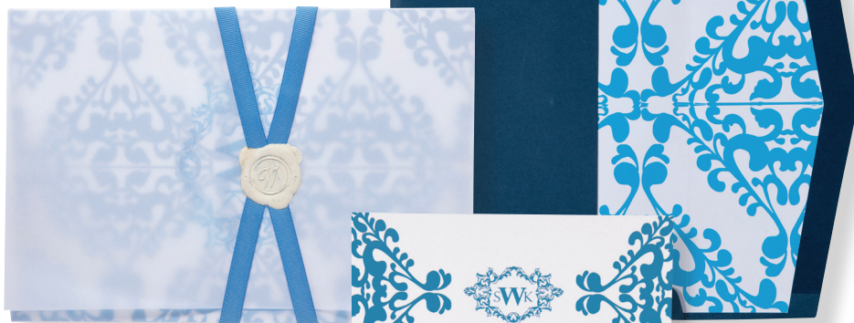
Double-sided, blue foil-stamped invitation sealed with wax and a satin ribbon, and envelope with custom liner by Oda Creative; odacreative.com