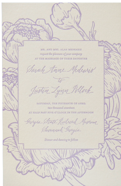
“Sarah & Justin” custom letterpress invitation featuring Charleston calligraphy style and illustrated botanicals on luxe cotton stock by Lowcountry Paper Co.; lowcountrypaperco.com