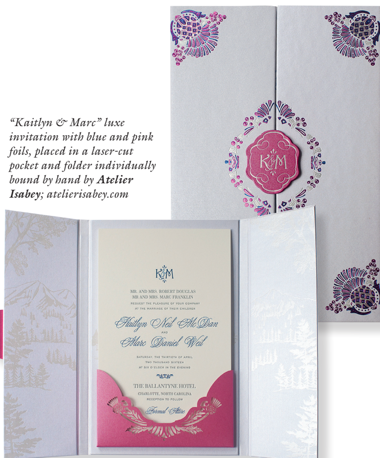
“Kaitlyn & Marc” luxe invitation with blue and pink foils, placed in a laser-cut pocket and folder individually bound by hand by Atelier Isabey; atelierisabey.com